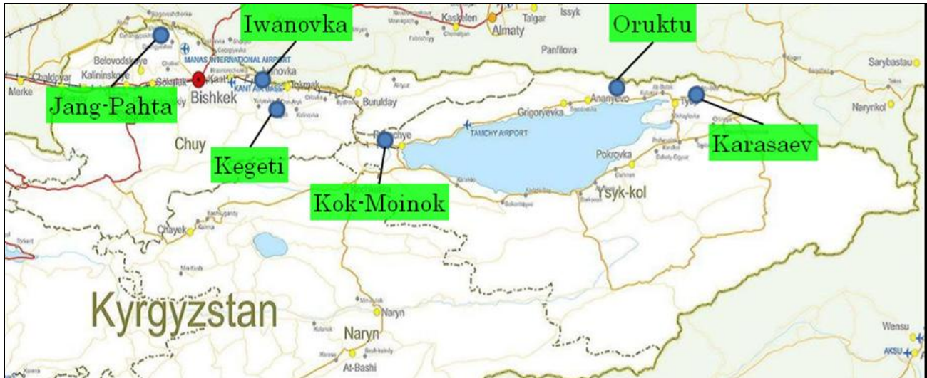
{Map of JFM Project Pilot Sites}

site should be reported to Unit of Forest Ecosystem Development (UFED) in SAEPF in each quarter of the year, for use of monitoring, analysis and discussion of the future JFM activities.